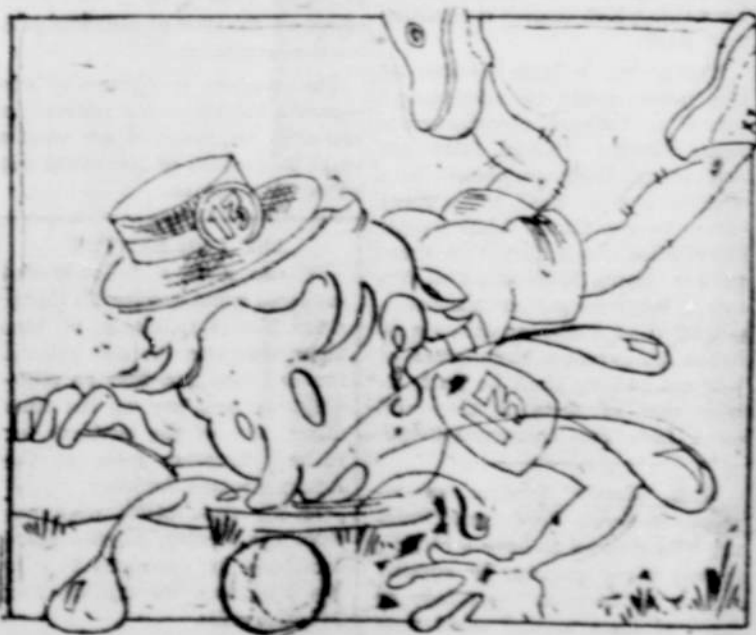
Softball—and soft ground, too! Safe at first! SAFE!