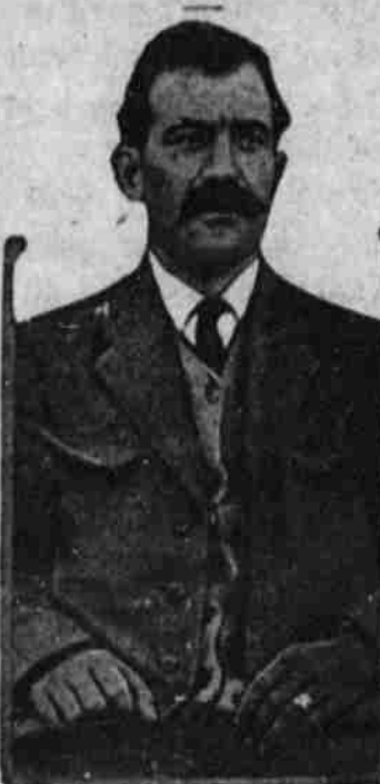
General Gonzales is a Carranza leader who is active in capturing Villa.

Infantry, cavalry and field artillery. The senate is expected to concur, and the necessary orders will be issued immediately to fill up regiments on border duty.