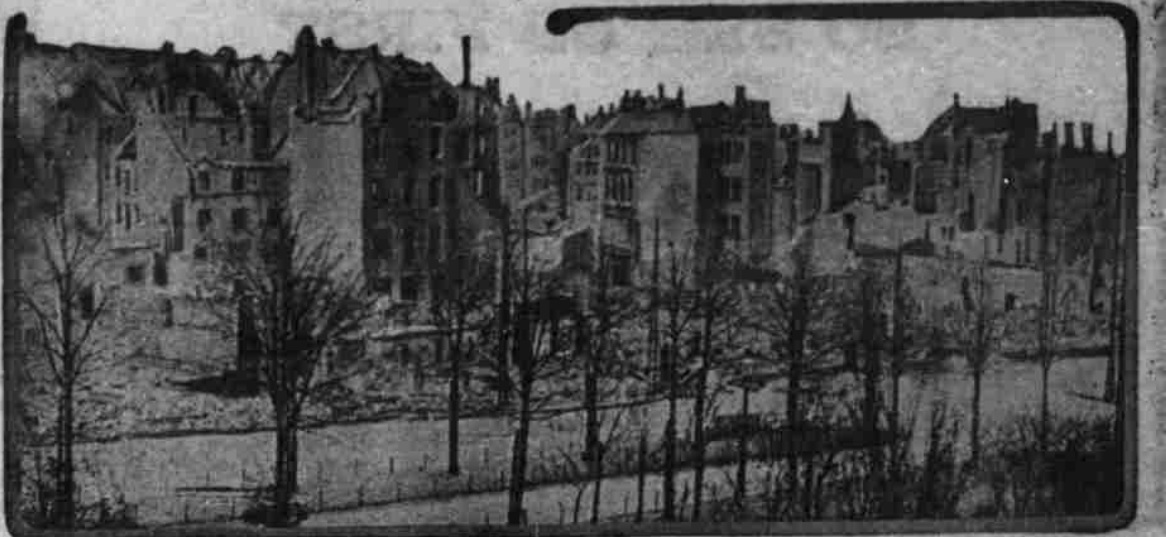
This view of Bergen, Norway's great fishing center and seaport, was taken after the recent conflagration which destroyed a large part of the city. Thousands of persons were made homeless and the damage was estimated at more than $20,000,000.