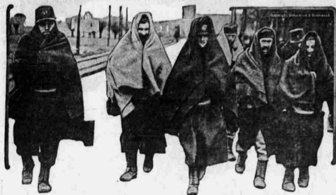
The soldiers of Belgium are poorly equipped for winter fighting, but blankets are being distributed among them as rapidly as possible.