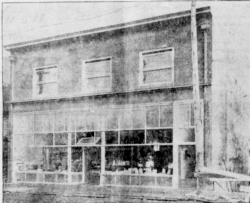
Lent and Campbell Building