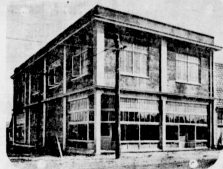
New L. O. O. F. Building