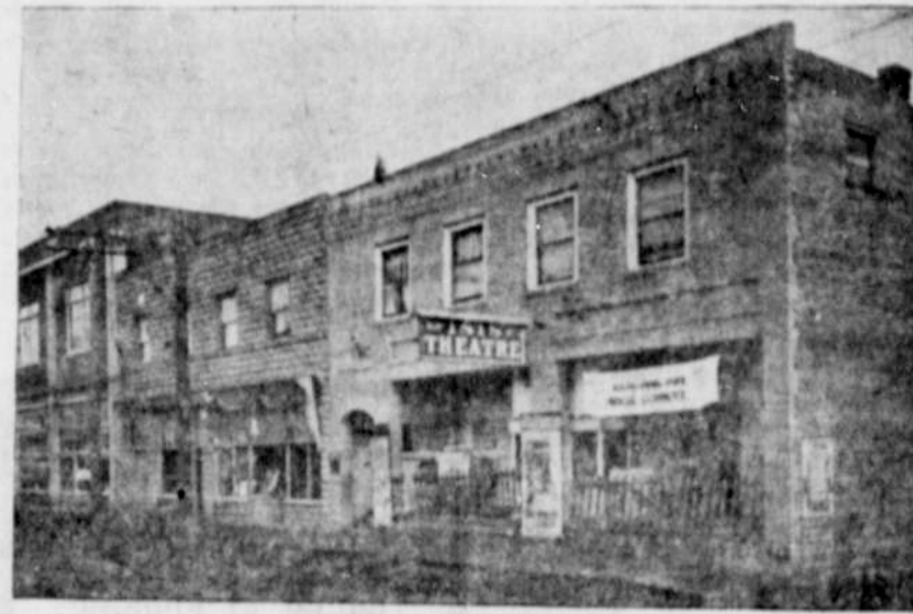
Isis Theatre, Herald Building—L. O. O. F. Hall