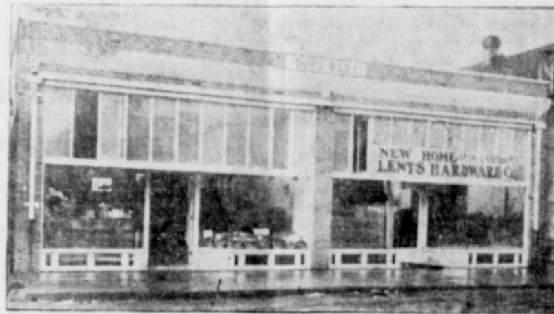
The New Duke Building

The Philippine bureau of forestry uses a launch for service between islands. The U. S. forest service employs several, both on island lakes and inland water, in Alaska and Florida.