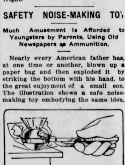
Safe Noise-Making Toy Embodying a Familiar Idea.

Nearly every American father has, at one time or another, blown up a paper bag and then exploded it by striking the bottom with his hand, to the great enjoyment of a small son. The illustration shows a safe noise-making toy embodying the same idea.