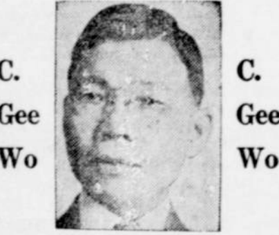
THE CHINESE DOCTOR

His Remedies Act Quickly and Painlessly.