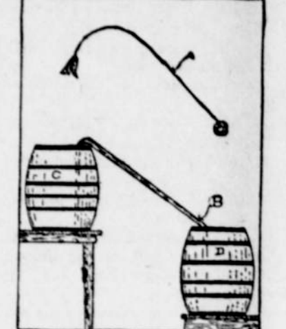
Emptying a Barrel.

Many ruralists now buy gasoline and lamp oil by the barrel, and to empty same is no small job. The idea herewith illustrated will be found not only easy, but sure and safe. The barrel to be emptied is left in the wagon, or placed on a bench, so the lower end is just above the barrel or other vessel in which you wish to store the oil. A piece of three-quarter inch hose of sufficient length to reach from the bottom of the barrel to be emptied and across to the storage tank is secured and used as shown, says the Iowa Homestead. C shows the barrel of oil, D is the storage tank or barrel, and A is a stout cord some two feet longer than the hose, B. The cord has a weight such as a small tap fastened to one end, and a bunch of