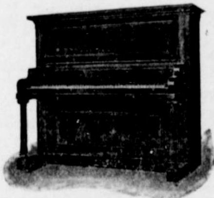
Purchased from Eilers Piano House Portland, Oregon