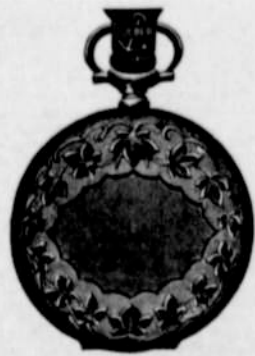
Purchased from Staples Jewelry Company Portland