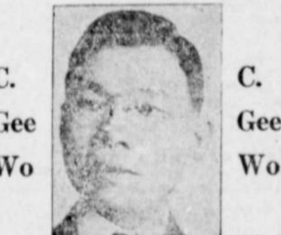
THE CHINESE DOCTOR