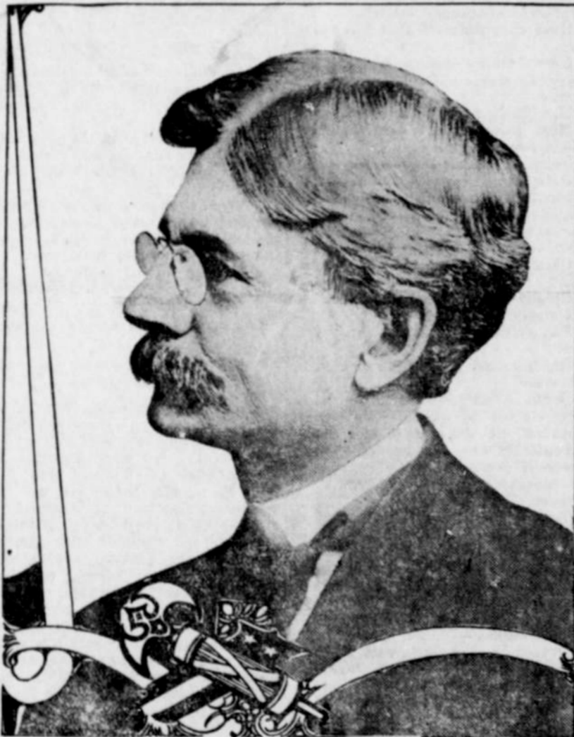
THOMAS RILEY MARSHALL