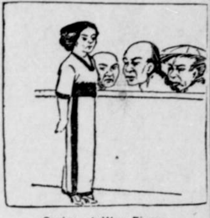
Gazing at Wax Figure.

Chinese merchants in Hongkong's Chinese quarter who have adopted this