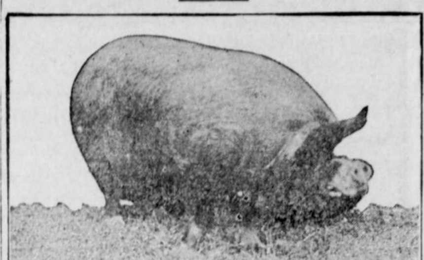
A Berkshire Champion.

Regardless of Breed, Animal Should Possess Certain Definite Characteristics Typifying Combination of Good Breeding With Individual Excellence-Hints for Summer Care.