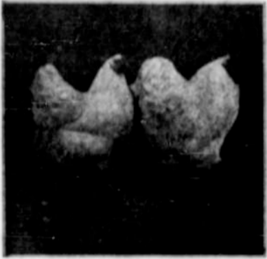
A pair of Prize Winners in last week's poultry show from a Lents yard.