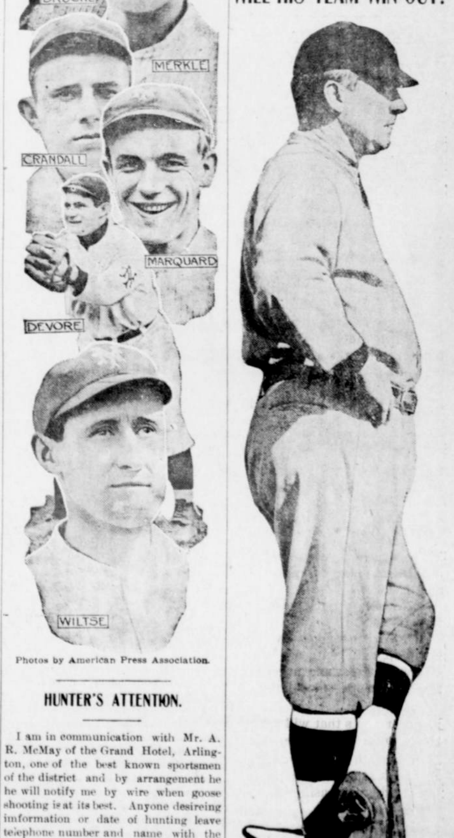
JOHNNY M'GRAW, LEADER OF THE GLANTS.