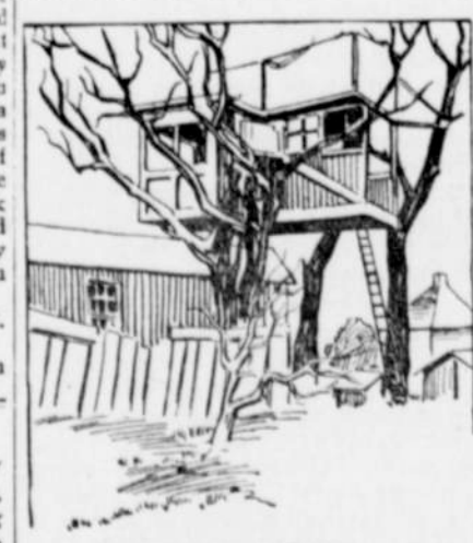
Has a Roof Garden.

The house will be illuminated by electricity and it will be substantially