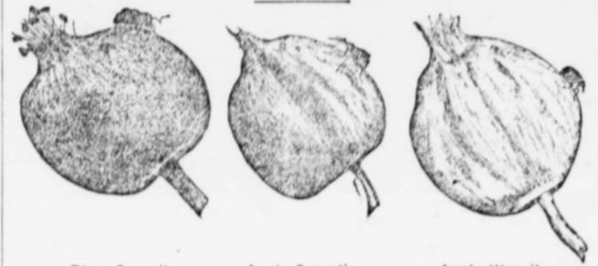
Plum Curculio. Apple Curculio. Apple Weevil.

Insect Is Distributed Over Practically All of United States East of Rocky Mountains and Has Been Rightfully Designated as Most Injurious of All Insect Enemies of Orchardists in Every Section.