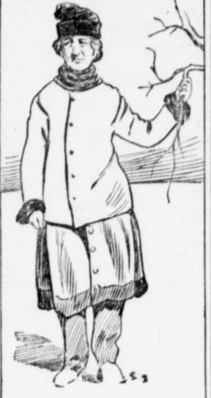
Forty Years in Bloomers.