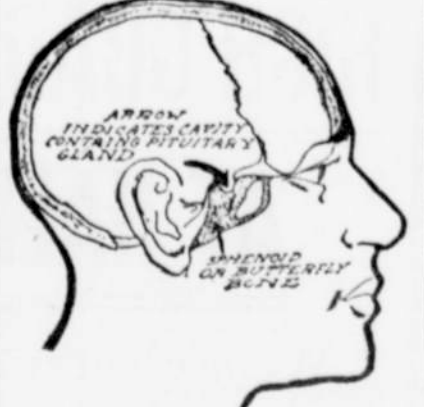
Location of the Gland.

Green for French Soldiers. Paris.—It is announced that the minister for war has decided to make an experiment with a new uniform at the September maneuvers. A special committee has chosen a uniform of a greyish-green color as being less conspicuous against a French landscape than the red trousers and blue coat now in service. The new uniform will be served out to at least a regiment for the experiment.