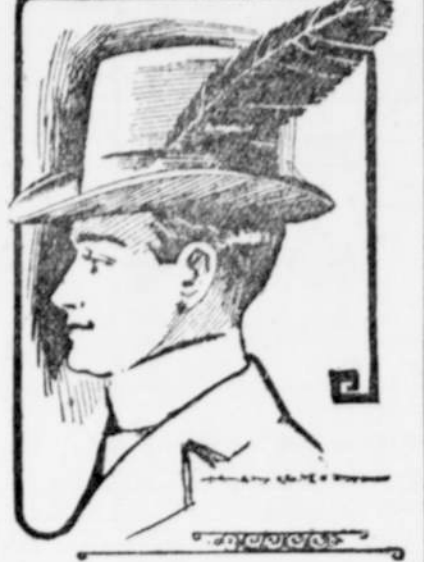
The Plumed Hat.

Chicago.—Plumed hats for men are the latest. They have made their appearance in Chicago and have caused a great wave of excitement among the fashionable men of the city. They are the biggest departure in masculine adornment made in a century, and are so decided a change from the conventional that leading hatmakers declare that a complete transformation in men's formal attire will be the result. The extreme styles in men's plumed hats will not become popular at once, say experts. Extreme styles never do. But observant persons have noticed that for several years many of the better dressed men of Chicago have