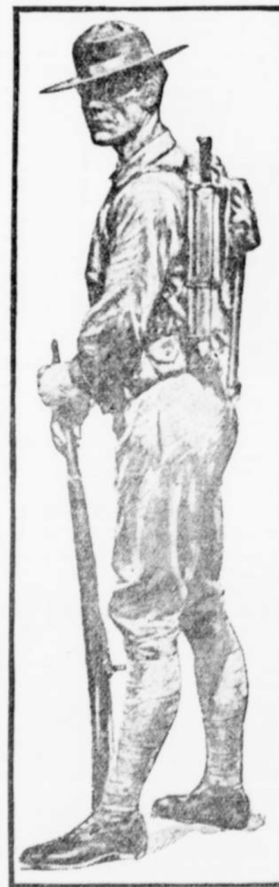
Infantryman in New Equipment.

The illustration shows a front view of the new equipment of the United States foot soldier with cartridge belt.