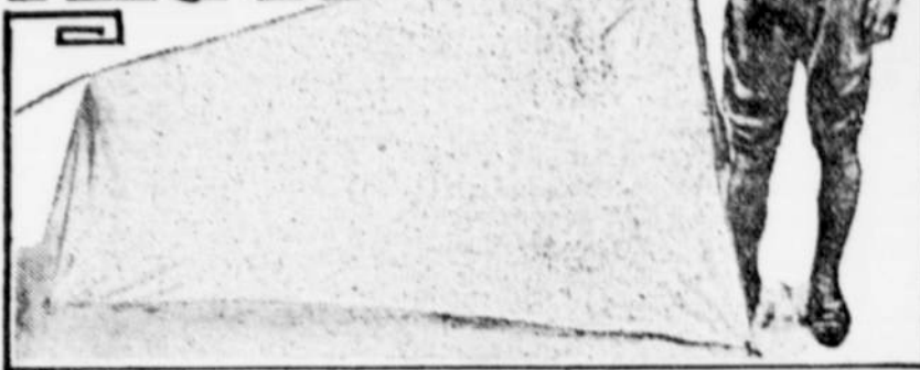
NEW EQUIPMENT WITH A RIFLE FOR THE JUNGLE PALE