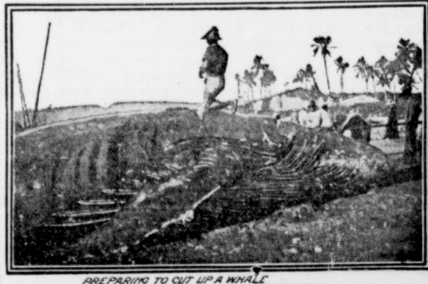
PREPARING TO CUT UP A WHALE

Arriving at the station, the whale is drawn up on the beach and cut up, the fat, called "blubber," being separated from the meat and bones. The pieces of blubber are then taken to the oil factory, where they are placed in large caldrons and the oil is tried out. HENRY W. FURNESS.