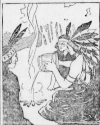
Indians' Infalible Test.

It was by this simple experiment that the term "firewater" became a