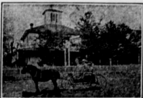
A PORTION OF THE CASCADE COURT.

Larks, like the gallinae, have a habit of dusting themselves by fluttering along the ground, and the dove colored species of the South Africa deserts delights in wallowing in sand.