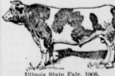
Illinois State Fair, 1908.

As a rule all compact clay soils may be greatly benefited by the application of one ton of lime per acre, just after breaking up, either in fall or spring, and thoroughly mixed with the earth. Lime should not be applied with manure of any kind, but the latter (manure) may be applied as a top dressing and worked in by cultivation of the crop. One application of lime every five years is usually sufficient.