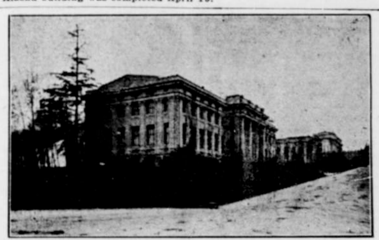
THE FINE ARTS PALACE, A.-Y.-P. EXPOSITION, SEATTLE.

In constructing its group of five buildings, the United States Government had regard for the type of architecture followed generally in the buildings of the Exposition proper. The Exposition structures are in the modern French renaissance and the Government in the modern Spanish. The two styles tie in nicely together and make an harmonious whole. On the right of the picture is the Alaska building, one of the Government group. In the center is the European Exhibits Palace. On the left is a facade of the Palace of Agriculture. The last two named are in the French renaissance and were completed before December 1, 1908. The Alaska building was completed April 15.