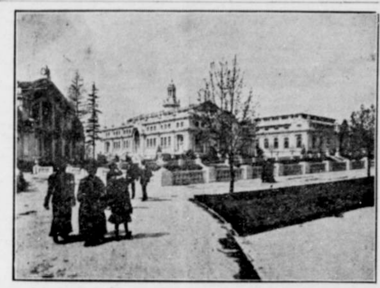
SCENE ON THE COURT OF HONOR, A.-Y.-P. EXPOSITION, SEATTLE.

Above Geyser Basin can be seen the banks of the Cascades, and around these are growing 100,000 rose bushes, so selected that there will be a rotation of blooms throughout the Exposition.