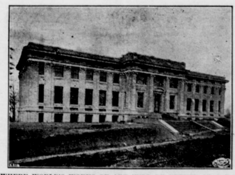
WHERE WORLD'S WORKS OF ART WILL BE HOUSED AT A.-Y.-P. EXPOSITION, SEATTLE.

The building is absolutely fireproof. It is of reinforced concrete and brick and, at the end of the Exposition, it will revert to the University of Washington, by which it will be need as a School of Chemistry.