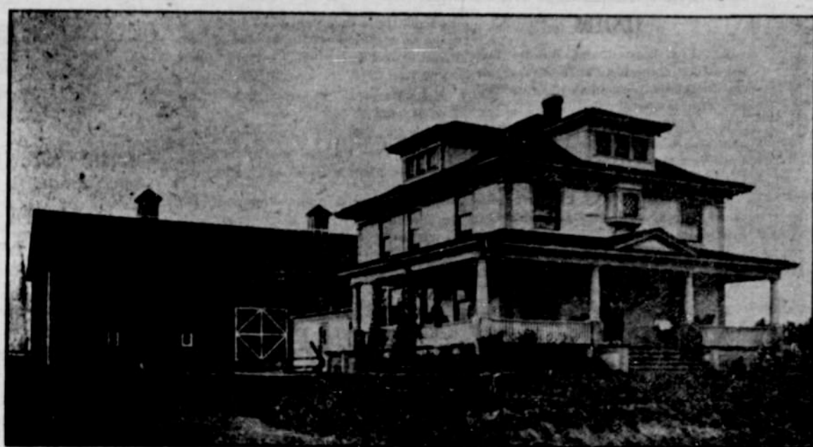
J. W. TOWNSEND'S NEW RESIDENCE AT FAIRVIEW

Special cars will be run from Portland to Fairview, bringing prominent Portland people who desire to invest in Fairview property. Among them are parties planning to establish a large general merchandise store in next 90 days.