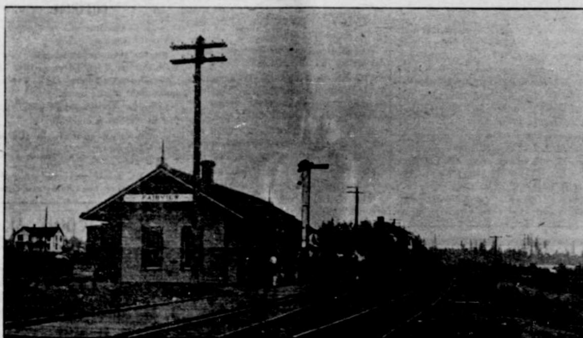
O. R. & N. DEPOT AT FAIRVIEW, SHOWING FREIGHT TRAIN, AGENT AND CREW