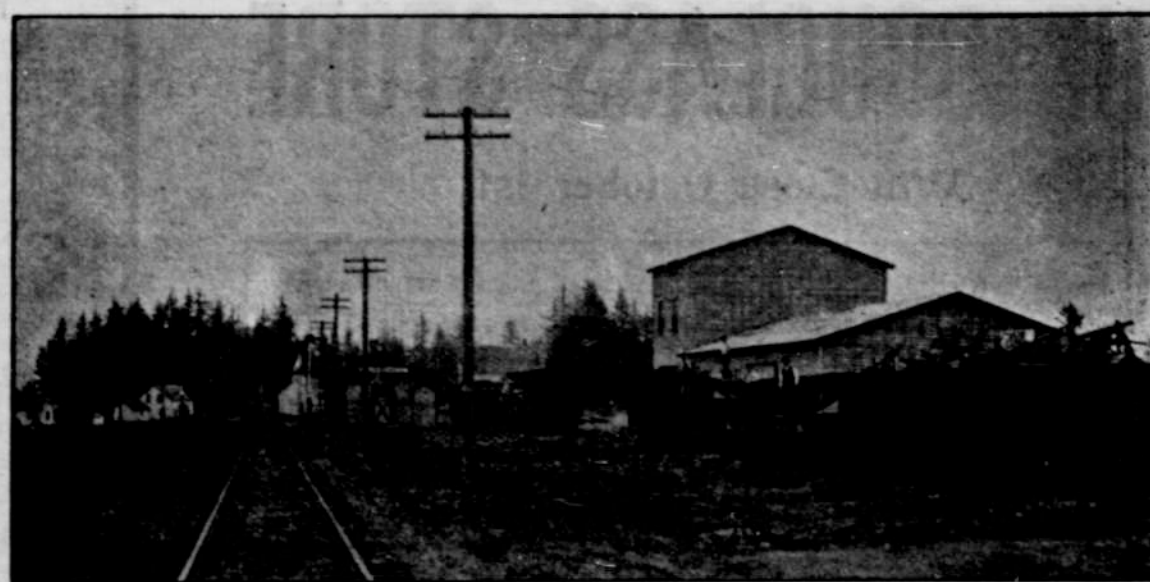
GENERAL VIEW OF DEPOT AND WAREHOUSE AT FAIRVIEW

Showing crew unloading grading outfit of Mt. Hood Railway and showing Methodist church and parsonage, and residences of G. O. Dolph and J. T. Stillion in the distance.