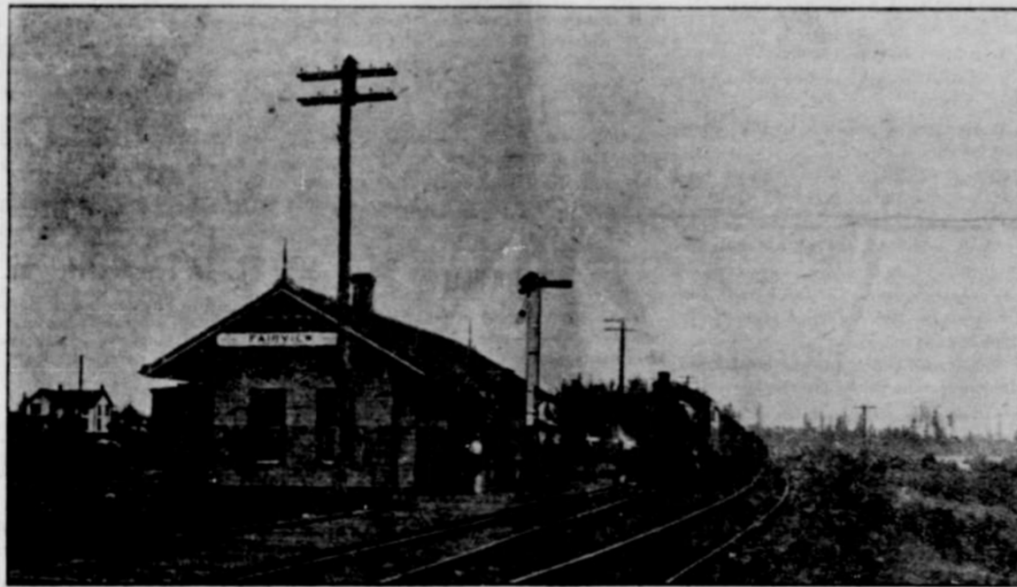
O. R. & N. DEPOT AT FAIRVIEW, SHOWING FREIGHT TRAIN, AGENT AND CREW