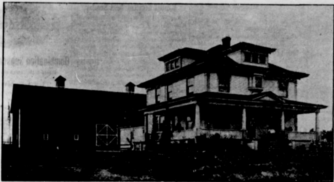
J. W. TOWNSEND'S NEW RESIDENCE AT FAIRVIEW

Special cars will be run from Portland to Fairview, bringing prominent Portland people who desire to invest in Fairview property. Among them are parties planning to establish a large general merchandise store in next 90 days.