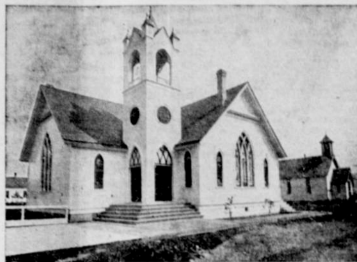
NEW LINNEMANN MEMORIAL METHODIST CHURCH, GRESHAM Which was dedicated last Sunday