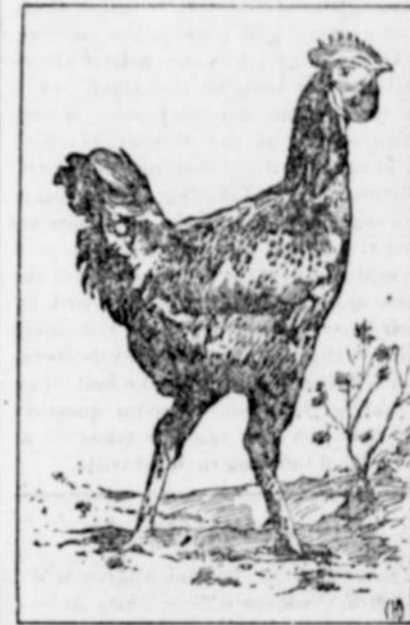
OLD STYLE LANGSHAN.

At any rate, many of the British breeders are arguing that the Langshan, under the requirements of the modern standard of perfection, is losing the characteristics which first made the breed popular and that its former remarkable utility qualities are being literally refined out of it. There is probably a kernel of truth in this charge but the first experiment looking toward what seems to be a step backward in poultry culture will be watched with interest. The illustration here with gives an excellent idea of a Langshan cock of the old type.