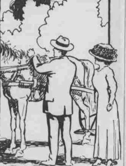
Her Frankness Was Disarming.

How to make the chickens pay, that was the question. A phrase, constantly repeated in the daily papers, recurred to him. The consumer's dollar. He must manage to get more of it. He had been shipping to a city commission house. Now there must be housewives in the village who