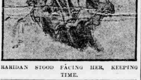
RARIDAN STOOD FACING HER, KEEPING TIME.

The call had been successfully managed. Miss Porter was very pretty, and not so young as Wheaton expected to find her. Raridan left him talking to her and went across to the library, where Mr. Porter was reading his evening paper. Raridan had a way of wandering about in other people's houses, which Wheaton envied him. Miss Porter seemed to take his call as a matter of course, and when her father came out presently and greeted him casually as if he were a familiar of the house he left relieved and gratified.