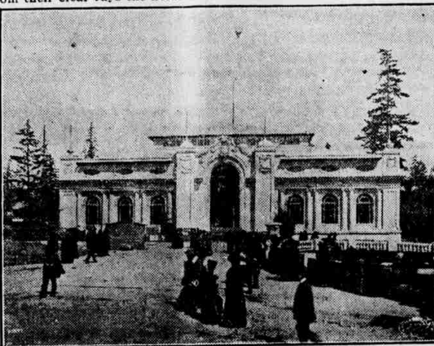
THE HAWAIIAN BUILDING, A.-Y.-P. EXPOSITION, SEATTLE.

At night when the long twilight of the northern latitudes close down, the manifold beauties of the spot show their greatest charm. With the fading of day comes the romance of evening and the millions of lamps, made brilliant by electricity, flash their rainbow tints over a land such as fairies might have builded. The rushing, tumbling torrents of the Cascades pour their enormous volume over a bed covered by electric bulbs, and from the quiet pool of Geyser Basin are reflected as in a mirror. Electroliers of French design are lavishly scattered beneath the trees, and from their clear rays the fields of flowers are seen in added hues.