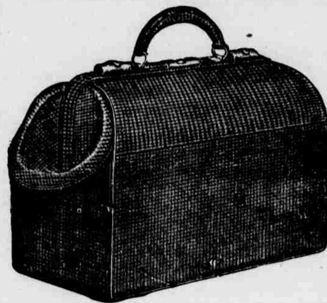
Notice Window Display and Prices

Grips Men's Oxford bags, selected light brown smooth grain leather, English hand sewed frame, brass trimmings, slide catches, leather lining, one full length and two gusseted pockets, 18 size $5 75 24 inch imitation leather suit case, fancy or plain canvas lined with shirt fold, large brass head rivets, solid leather corners, round sewed handles steel frame. Price.....$2 00 Heavy leather, straps around outside, brass lock and catches, heavy corners, extra deep case, fancy canvas lined with shirt fold, 24 inch.....$7 50 24 inch case made of selected stock from case leather, steel frame, brass lock and catches, sewed leather handles heavy leather corners, full leather lined with shirt fold, sewed.....$10 00 Selected cowhide leather, heavy straps around shaped leather, anchor handle, plain canvas lined with shirt folds inside straps, 36 inch.....$5 00