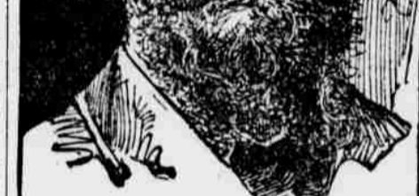
ALGERNON CHARLES SWINBURNE.

Don't kick a man to-day because he is down. You may be down to-morrow.