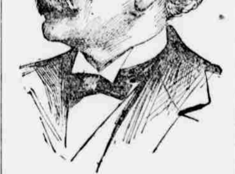
ETHAN ALLEN HITCHCOCK.

The death of Ethan Allen Hitchcock, Secretary of the Interior under Presidents McKinley and Roosevelt, removed a statesman whose record for honesty and whose high sense of duty were recognized by his country. Mr. Hitchcock was the grandson of General