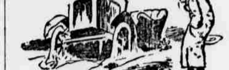
The Angry Blatter.