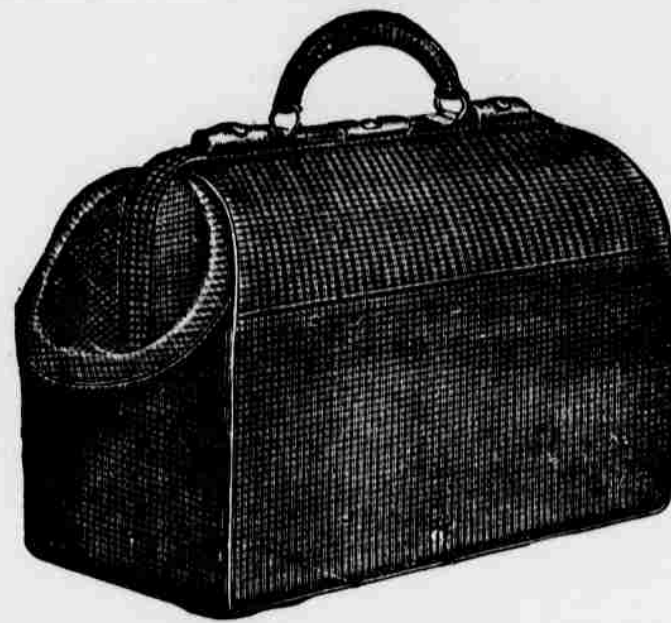
Notice Window Display and Prices

Selected cowhide leather, heavy straps around shaped leather, anchor handle, plain canvas lined with shirt folds, inside straps, 36 inch.....$5 00