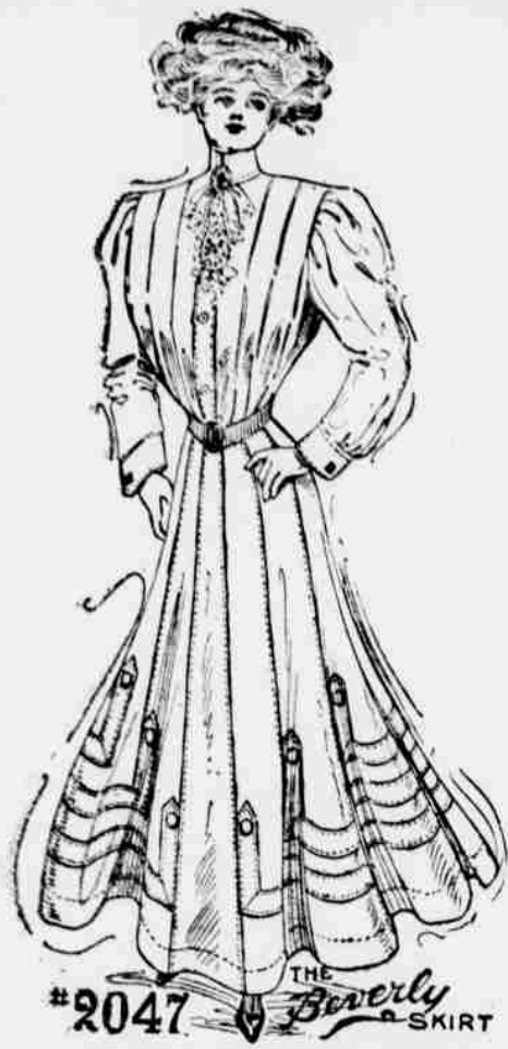
#2047 The Beverly SKIRT The Store That Strives to Please