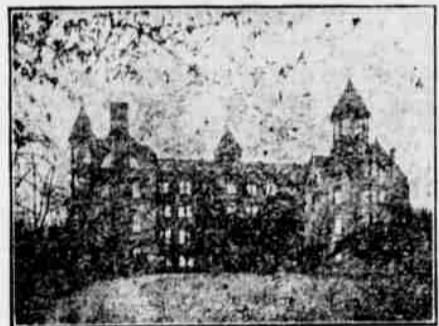
St. Helen's Hall, Portland, Or. Resident and Day School for Girls. Catalogue on Request.

The best kind of a testimonial— "Sold for over sixty years!" Made by J. C. Ayer Co., Lowell, Mass. Also manufacturers of Ayer's SARSAPARILLA, PILLS, CHERRY PECTORAL.