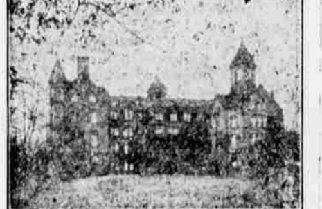
St. Helen's Hall, Portland, Or. Resident and Day School for Girls. Catalogue on Request.