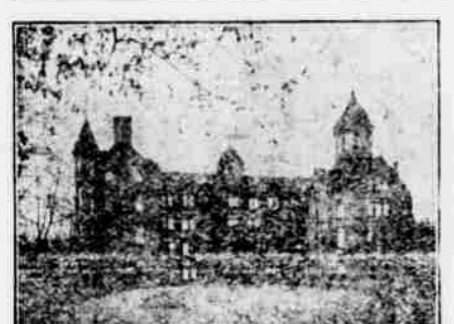
St. Helen's Hall, Portland, Or. Resident and Day School for Girls. Catalogue on Request.

THE DAISY KILLER destroys all the daisy beetles, and keeps them from coming back. It is a sure and certain remedy for all daisy beetle troubles. It is sold in all parts of the world.