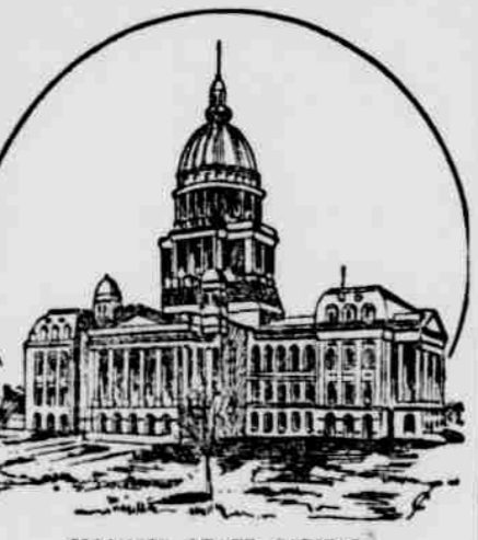
ILLINOIS STATE CAPITOL.