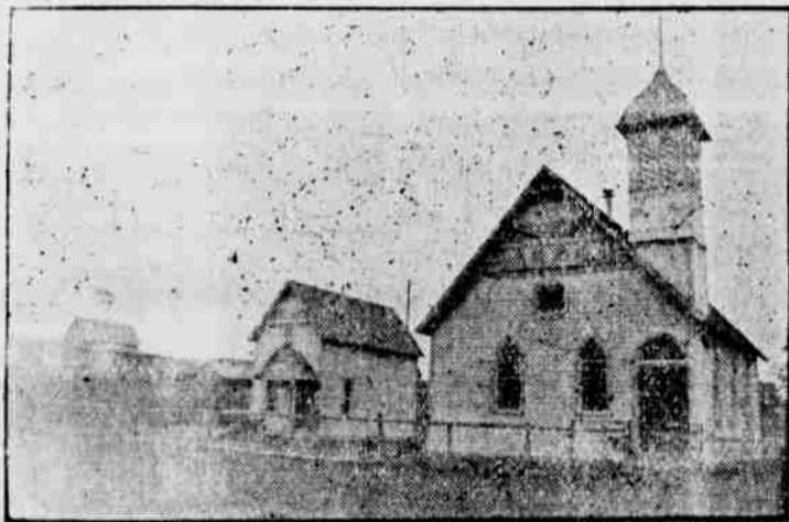
M. E. CHURCH, SOUTH

is raised. Fruit of a good quality is produced. Apples, plums, and small fruits are produced in abundance. All the standard vegetables can be raised easily.