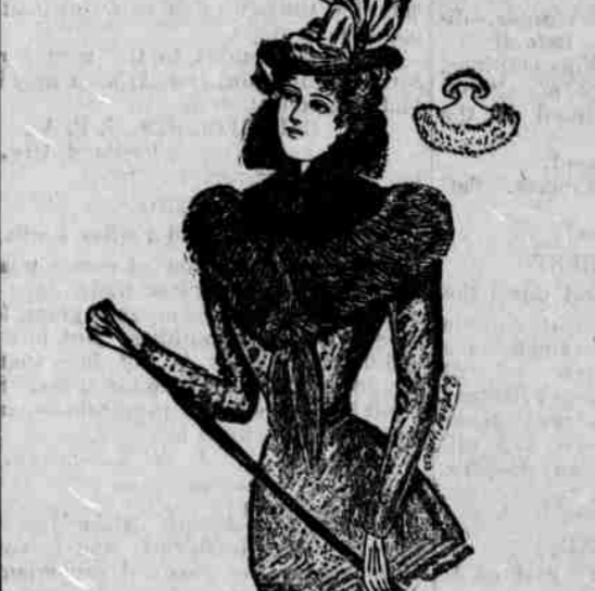
The above are only a few items to show you what you can do.

Fine line of Infants' Cloaks from 95c up—here is another instance where we have slaughtered prices.