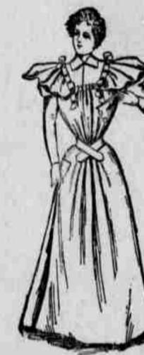
TABLE OIL CLOTH, 20c A YARD LADIES' WRAPPERS. We carry a Fine Selection of these Goods. All have extra waist linings and are nicely trimmed, and the skirts are wide. The materials are Percales, Lawns, Organdies and Prints, and run in price from 73 cents to $2 89.

LADIES' SHIRT WAISTS. You can get an idea of the popularity of our Waists and the prices they go at when we tell you that the first shipment is already exhausted, but more will arrive ere this reaches you. The price on percales starts at. . . . 50c " " French lawns and organdies starts at. . . . 83c The price on white starts at. . . . 93c.