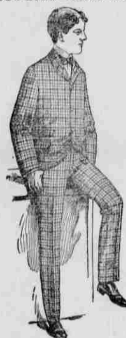
BOYS' LONG PANTS SUITS.