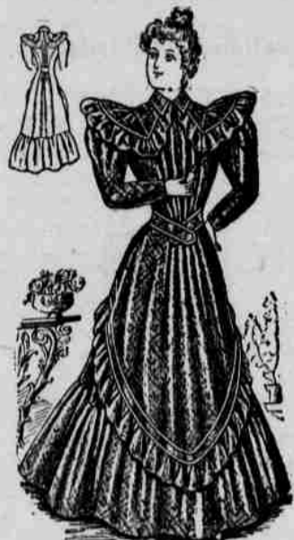
805 Is a very fine quality picture-trimmed apron front, trimmed with white embroidery and braid, like above cut... 2.48