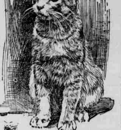
SEÑOR CRISTOBAL COLON.

The famous Spanish cat, Cristobal Colon, captured from the Spanish battleship on July 3, died at the United