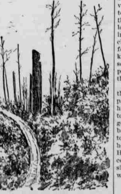
BURNED FOREST AFTER TWENTY YEARS.

In October, 1871, one of the most terrible fires in America on record broke out at Peshtigo, Wis., and more than 700 persons were burned to death. But probably the saddest fire was that which occurred in 1894—one glimpse of which at Phillips, has already been had. The unfortunate place was Hinckley, Minn., and the calamity oc-