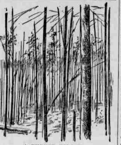
A BURNED FOREST.

A forest denuded by fire presents a woeful sight. The trees are not entirely consumed. The burned trunks of all larger ones stand straight and tall, dead, but not destroyed. Sometimes forest fires rage over such vast areas that their smoke is visible from any point in a State. Dr. J. T. Deobrock, Commissioner of Forestry for Pennsylvania, shows that the potential loss of