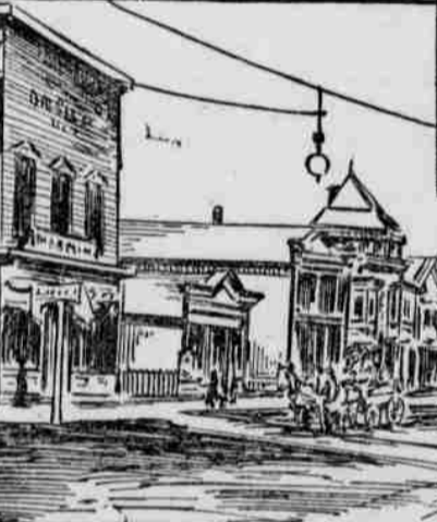
STREET IN PHILLIPS BEFORE AND AFTER THE FIRE.

The illustrations are significant as showing the desert condition which a fire, or series of fires, produces. In many parts of the United States one may see such tracts, over which fires have swept almost every year, destroying the young forest growth and rendering the soil, after each succeeding