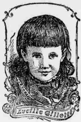
Catarrh in the Head

About Twenty cords Of good pine wood Are needed at the Gazette Office on subscription at once.