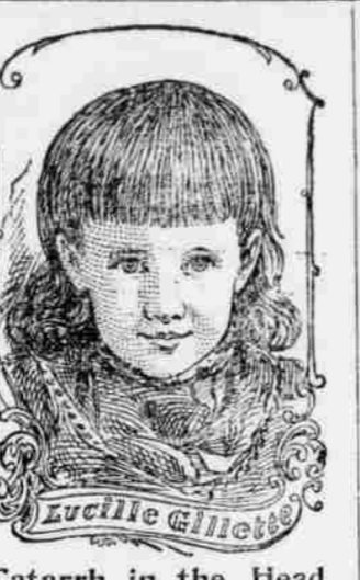
Catarrh in the Head

Book keepers and others of sedentary habits cure constipation with Simmons' Liver Regulator.