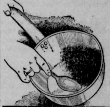
Cook to dryness one pint of tomatoes. Then cover a lot of RUBY RED TOMATOES TEN MINUTES. Then pour in boiling water, increase the heat, boil for minutes and clean out with a wooden spoon. The stems will not be injured.

801 acres, 2 miles from Perrydale on county road; 175 acres in cultivation; 8 acre orchard; creek crosses place; some improvements, will sell all or in small tracts or will trade for small place near Dallas or Falls City.