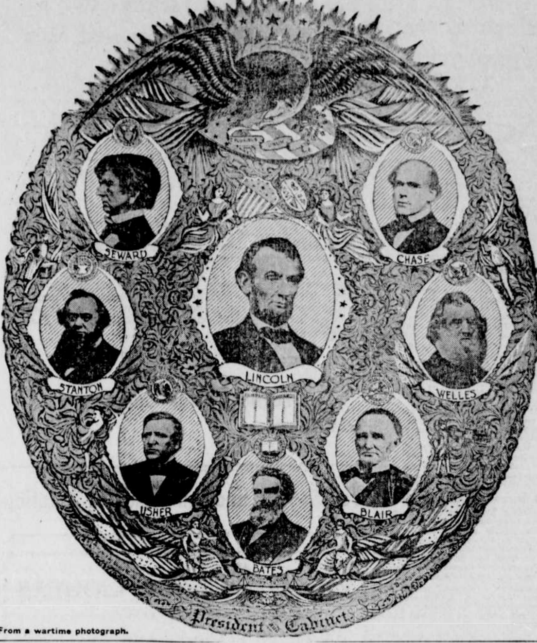
From a wartime photograph.