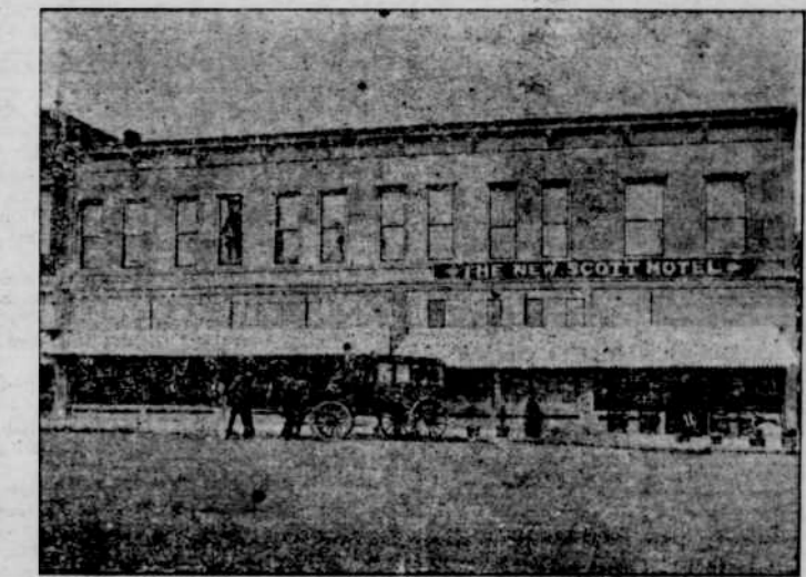
NEW SCOTT HOTEL

Itemizer Advertisements Always Prove Profitable