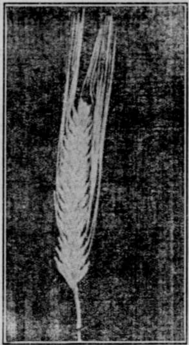
HEAD OF GOLDTHROAT BARLEY.

According to the prevailing opinion, which, according to some American growers, are mere prejudices, the best hops are raised in Bohemia, Bavaria and some parts of England, notably Kent. Most American brewers as well as their European brothers value hops largely by their appearance and their aroma. This matter is being