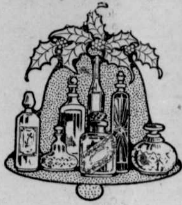
What is more gladly received than an elegant piece of Cut Glass such as you can buy here at prices from $2.00 to $36.00.

T HE Fuller Pharmacy has always been known as the store where you get the best and this fact is more prominent this year than ever. There are hundreds of holiday suggestions here for you to choose from. Prices always right, as low as possible, consistent with the quality of the article. And while our stock is large, yet it is wise to not delay making your selections until the last minute. Choose early and let us lay the goods away for you.