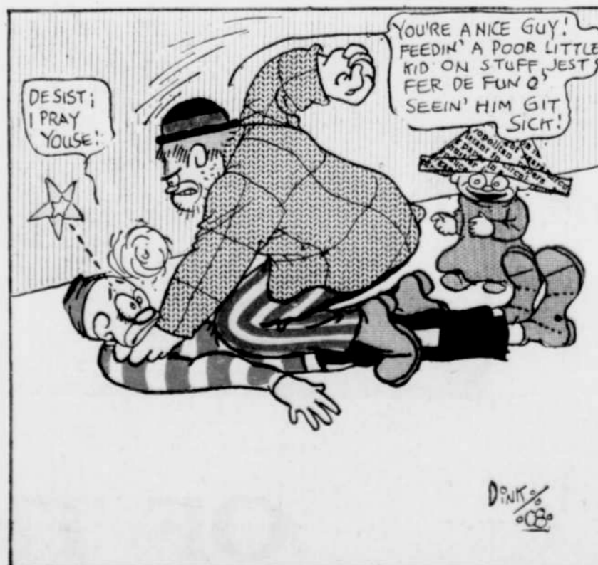
DESIST; I PRAY YOUSE! YOU'RE A NICE GUY! FEEDIN' A POOR LITTLE KID ON STUFF JEST FER DE FUN O' SEEIN' HIM GIT SICK!

SUBSCRIPTION (10c) ADDITIONAL (5c) 'PHONES: BE Patronize One