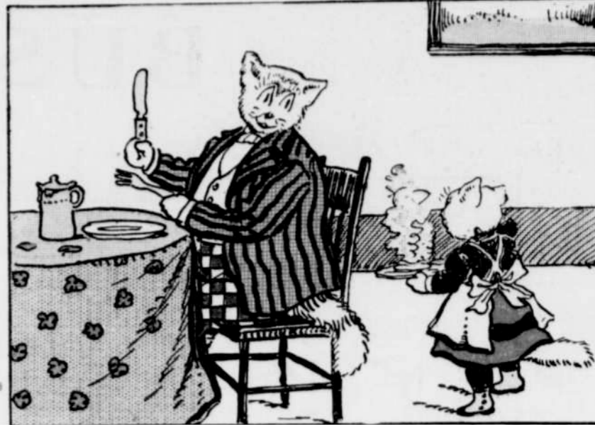
Her batter-cakes delicious were! Her bacon and her eggs, — They surely reached Paws' stomach! — And Her coffee knew no dregs.