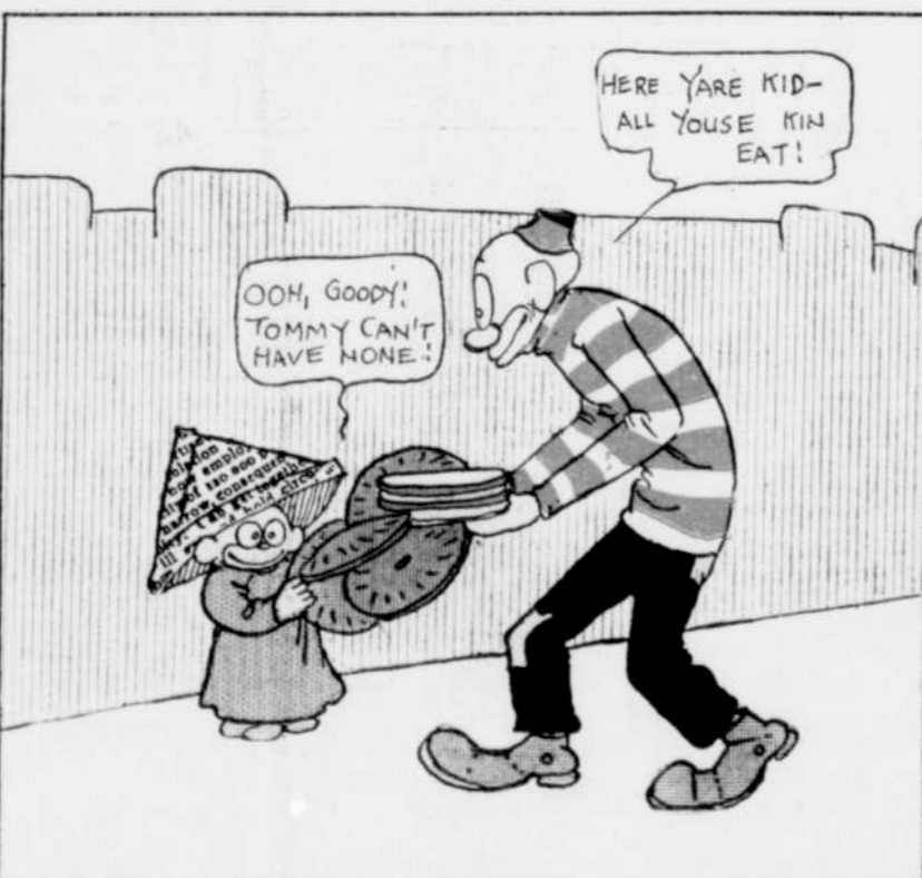
HERE YARE KID- ALL YOUSE KIN EAT! OOH, GOODY! TOMMY CAN'T HAVE NONE!