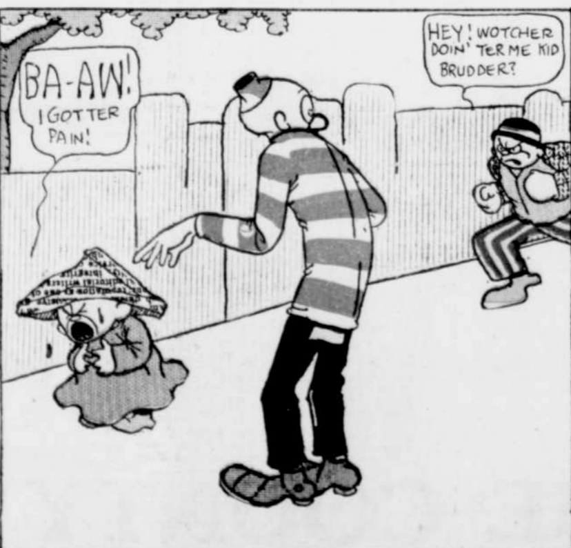
BA-AW! I GOTTER PAIN! HEY! WOTCHER DOIN' TER ME KID BRUDDER?