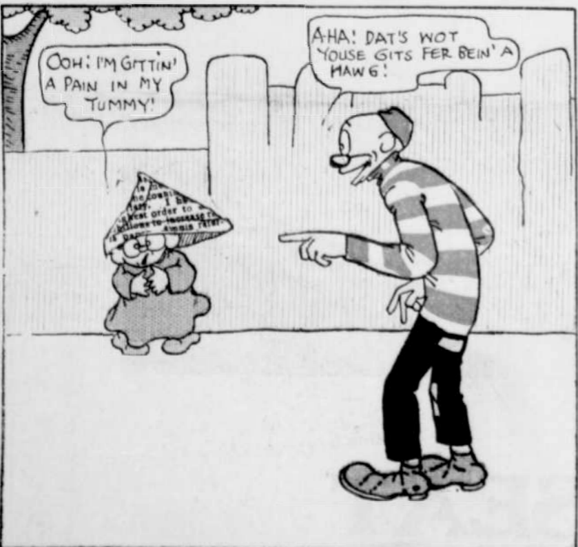
OOH! I'M GETTIN' A PAIN IN MY TUMMY! AHA! DAT'S WOT YOUSE GITS FER BEIN' A MAW!