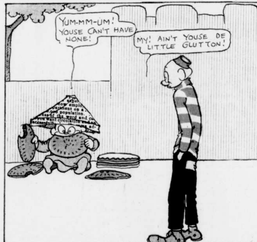
YUM-MM-UM! YOUSE CAN'T HAVE NONE! MY! AIN'T YOUSE DE LITTLE GLUTTON!