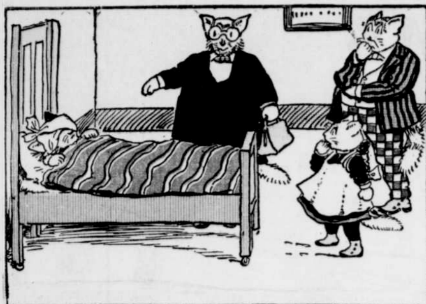
'Twas "Erisyplas" in her eyes! — That's what the Doctor said. Then Finkie had to learn to cook, While Maw lay sick-a-bed.