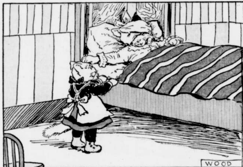
"My little daughter, may God bless! Protect you through your life! As good a daughter, may you have, If e'er you be a wife!"