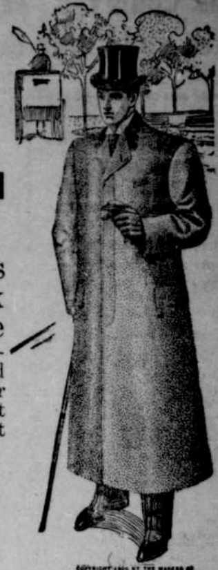
MICHAELS-STEIN FINE CLOTHING MICHAELS, STEIN & CO. DALLAS, TEXAS

The Uglow Clothing House is known from one end of Polk County to the other for the Quality of its goods, and such an opportunity to obtain bargains may never be offered to you again. Everything will be sold for cash, so bring along your purse. You won't need much money to buy a lot of goods at this sale.