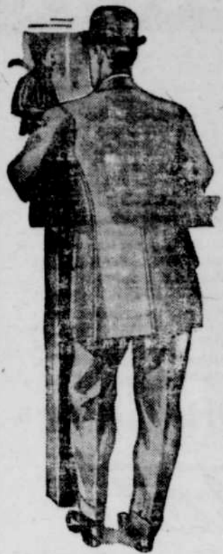
Copyright 1907 by the makers of MICHAELS-STEIN FINE CLOTHING MICHAELS, STEIN & CO. DALLAS, TEXAS

The greatest cloudburst of clothing bargains ever known in Dallas will break loose with a rush on the morning of—